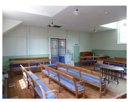
Statement of Significance

The meeting house at Maldon has high heritage significance as an early nineteenth-century building with original furnishings and a burial ground.